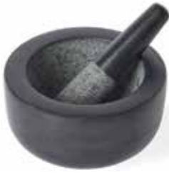
BLACK GRANITE MORTAR & PESTLE

3877 7" Diameter Black Granite Box, 1 per case 0-30734-03877-2