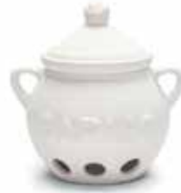
GARLIC KEEPER 3971 Ceramic Box, 36 per case 0-30734-03971-7