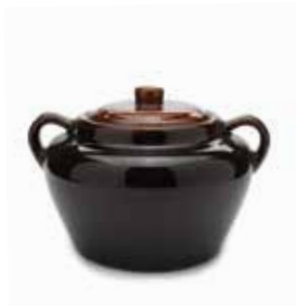
STONEWARE BEAN POT 0350 3.5 qt. Box, 1 per case 0-30734-00350-3