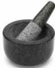
GRANITE MORTAR & PESTLE

3877 7" Diameter Black Granite Box, 1 per case 0-30734-03877-2