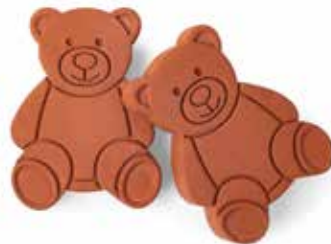
NEW BROWN SUGAR BEAR, SET OF TWO 46762 Box, 6 per case 0-30734-46762-6