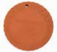
BREAD WARMER 4675 4.5", Terra Cotta Box, 12 per case 0-30734-04675-3