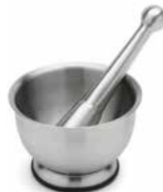
STAINLESS STEEL MORTAR & PESTLE

3868 4" / Granite Box, 1 per case 0-30734-03868-0