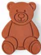
NEW BROWN SUGAR BEAR 46761 Box, 12 per case 0-30734-46761-9