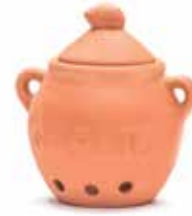
GARLIC KEEPER 3936 Terra Cotta Box, 6 per case 0-30734-03936-6