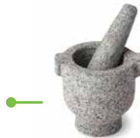
GRANITE MORTAR & PESTLE WITH FLANGE

3868 4" / Granite Box, 1 per case 0-30734-03868-0