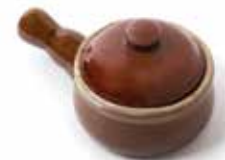
STONEWARE ONION SOUP BOWL 0349 UPC Sticker, 4 per case 0-30734-00349-7