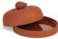
GARLIC BAKER 3921 7" Box, 3 per case 0-30734-03921-2