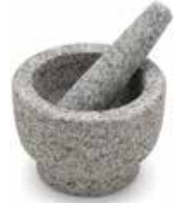
GRANITE MORTAR & PESTLE

3876 4" x 2" / Granite Box, 1 per case 0-30734-03876-5