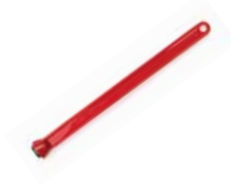
MAGNETIC CANNING LID WAND