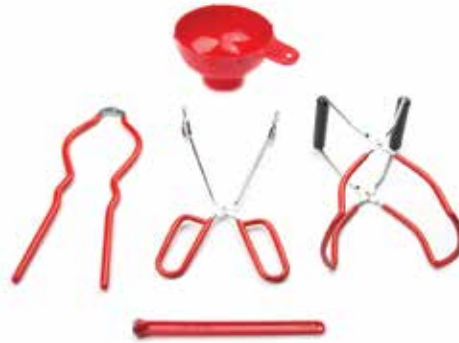
5 PIECE CANNING SET