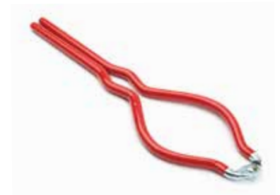
JAR & BOTTLE WRENCH