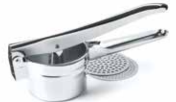
RICER / FRUIT PRESS