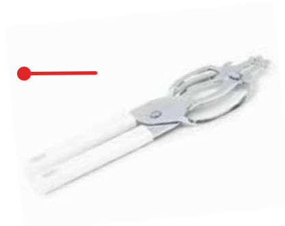
JAR & BOTTLE VISE