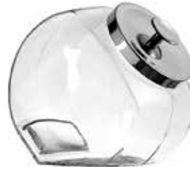
PENNY CANDY JAR

79065 UPC Label, 4 per case 076440698572