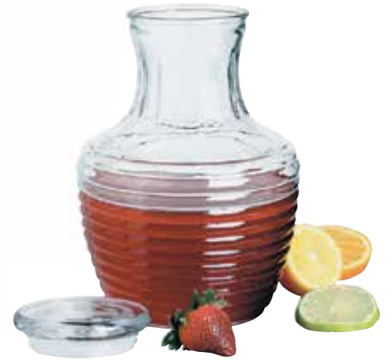
CHILLER 64 OZ. WITH GLASS LID

79010 UPC Label, 6 per case 076440812756