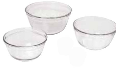
3 PC. MIXING BOWL SET (1 QT., 1.5 QT., 2.5 QT.)

Label/Shrink Wrap 2 per case 076440826654