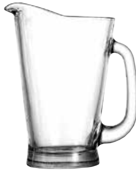
BEER WAGON 55 OZ. PITCHER

78019 UPC Label, 6 per case 076440930849