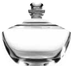
8 OZ. PRESENCE SUGAR

79112 UPC Label, 4 per case 076440641929