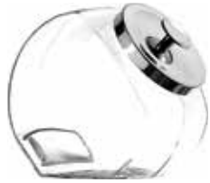
PENNY CANDY JAR (1/2 GALLON)

79065 UPC Label, 4 per case 076440698572