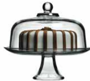
PRESENCE CAKE SET