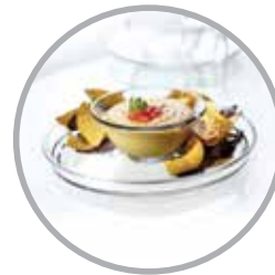
Chip and Dip Set