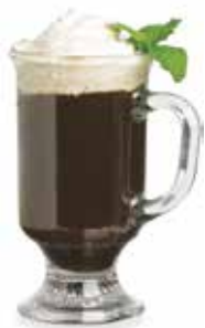
IRISH COFFEE MUG

77998 UPC Label, 12 per case 076440697384