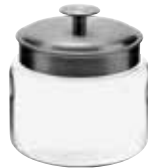
48 OZ. MINI MONTANA JAR WITH BRUSHED ALUMINUM COVER

77900 UPC Label, 2 per case 076440693720