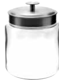
96 OZ. MINI MONTANA JAR WITH BRUSHED ALUMINUM COVER

77977 UPC Label, 2 per case 076440955408