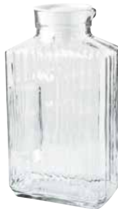
BISTRO PITCHER (2 QUART)

79056 UPC Label, 6 per case 076440934113