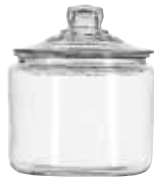
HERITAGE HILL CANISTER JAR (3 QUART)

77916 UPC Label, 2 per case 076440855456