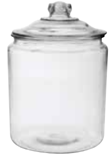
HERITAGE HILL CANISTER (2 GALLON)

77901 UPC Label, 2 per case 076440693492