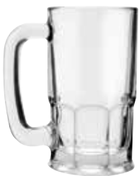
BEER WAGON MUG (20 OZ.)

79013 UPC Label, 4 per case 076440834673