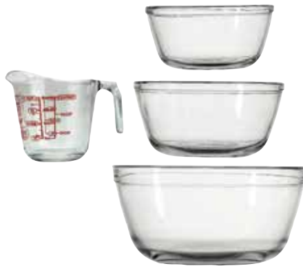
4 PC. SET (1.5 QT., 2.5 QT., 4 QT. MIXING BOWL WITH 8 OZ. MEASURING CUP)