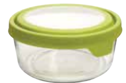
7 CUP ROUND STORAGE