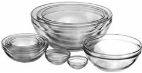
10 PC. NESTING MIXING BOWL SET