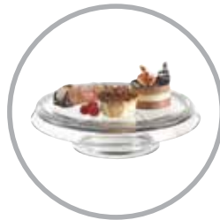
Pastry / Dessert Stand