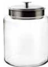
2 GALLON MONTANA JAR WITH BRUSHED ALUMINUM COVER

77985 UPC Label, 1 per case 076440955064