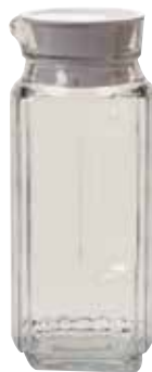
BISTRO PITCHER (1 QUART)

79009 UPC Label, 6 per case 076440930016