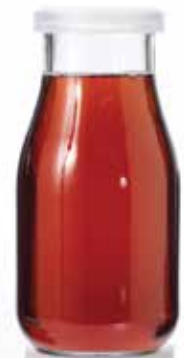
16 OZ. MILK BOTTLE ROUND WITH PLASTIC LID

79011 UPC Label, 4 per case 076440932218