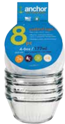
6 OZ. CUSTARD CUP / LID (SET OF 8)

77938 UPC Label, 4 per case 076440969344