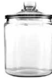
HERITAGE HILL CANISTER (1 GALLON)

77917 UPC Label, 1 per case 076440698329