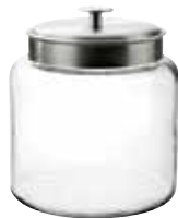
1.5 GALLON MONTANA JAR WITH BRUSHED ALUMINUM COVER

77978 UPC Label, 2 per case 076440955415