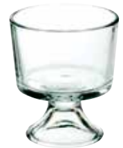
INDIVIDUAL TRIFLE/FRUIT BOWL

77910 UPC Label, 2 per case 076440892697