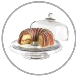
Cake Stand with Lid