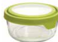
4 CUP ROUND STORAGE