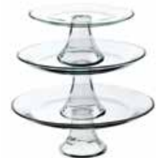
3 PC. PLATTER SET