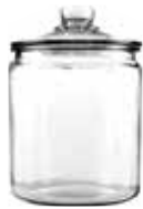
HERITAGE HILL CANISTER (1/2 GALLON)

77916 UPC Label, 2 per case 076440855456