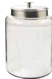
2.5 GALLON MONTANA JAR WITH BRUSHED ALUMINUM COVER

77986 UPC Label, 1 per case 076440915235