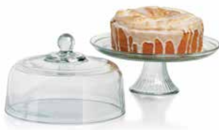
CANTON CAKE STAND