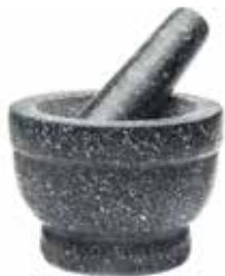
GRANITE MORTAR & PESTLE

3.9" x 2.6" / Cast Iron Box, 6 per case 0-30734-03861-1