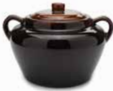
STONEWARE BEAN POT

0350 3.5 qt. Box, 1 per case 0-30734-00350-3