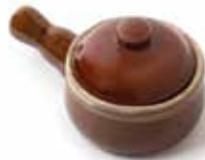
STONEWARE ONION SOUP BOWL

0350 3.5 qt. Box, 1 per case 0-30734-00350-3