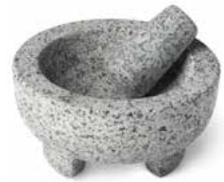
GRANITE MOLCAJATE MORTAR & PESTLE

3867 8" / Granite Box, 1 per case 0-30734-03867-3