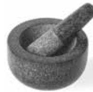
GRANITE MORTAR & PESTLE

3862 4.7" x 2.75" / Granite Box, 1 per case 0-30734-03862-8