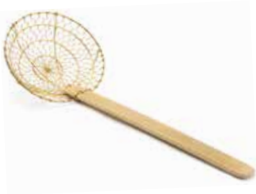
BRASS WIRE SKIMMER