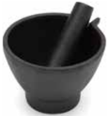
CAST IRON MORTAR & PESTLE