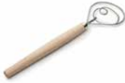
DANISH DOUGH WHISK

5836 12" Hang Tag, 12 per case 0-30734-05836-7