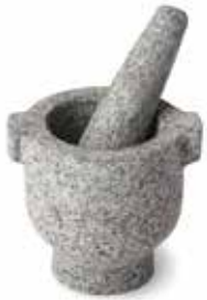
GRANITE MORTAR & PESTLE WITH FLANGE

3868 4" / Granite Box, 1 per case 0-30734-03868-0