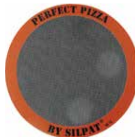
NEW Silpat® Perfect Pizza 0238 Size: 12" Peggable Box, 12 per case 814442009237