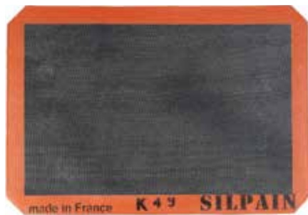
Silpain® Half Size The Silpat® for Bread 0223 Size: 11 5 / 8 " x 16.5" Peggable Box, 12 per case 814442002962