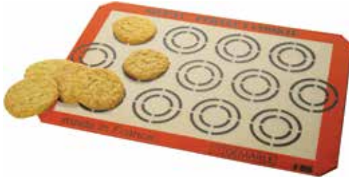
Silpat® Perfect Cookie 0234 Size: 11 5 / 8 " x 16 1 / 2 " Peggable Box, 12 per case 814442007325