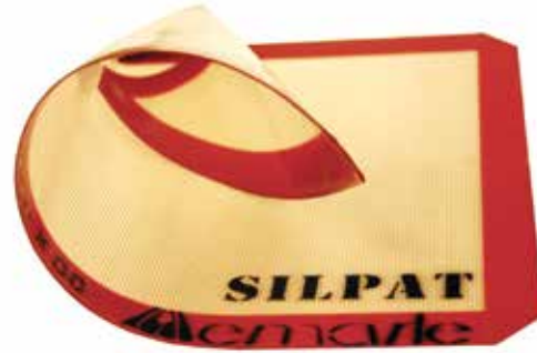
Silpat® Full Size Silicone Baking Mat 0225 16.5" x 24.5" Peggable Box, 1 per case 814442009152