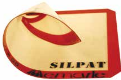
Silpat® Half Size Silicone Baking Mat 0221 16.5" x 11.75" Peggable Box, 2 per case 814442002405