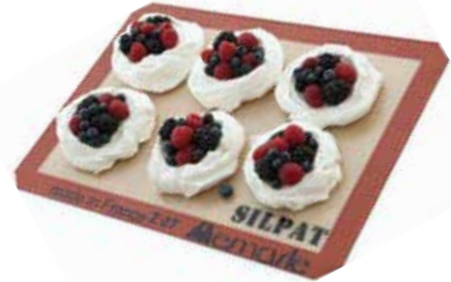
Silpat® Toaster Size 0227 Size: 10 7 / 8 " x 7 7 / 8 " Peggable Box, 12 per case 814442002757