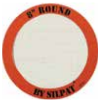
NEW Silpat® Round Mat 0236 Size: 8" Peggable Box, 12 per case 814442009213