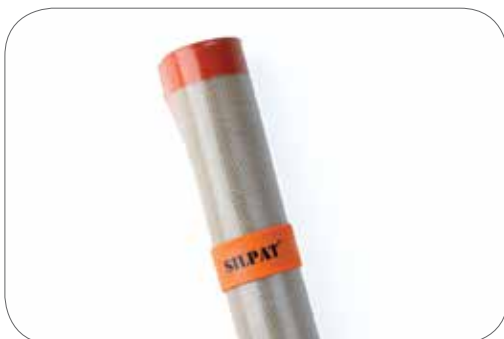
NEW Silpat® Sil-Band 0239 Card, 12 per case 814442009244