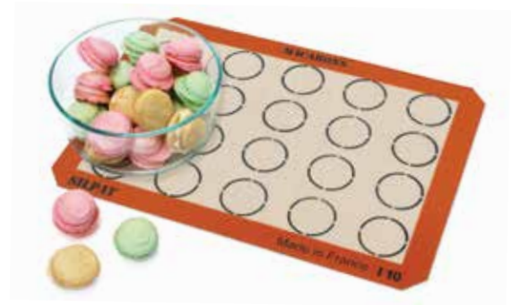
Silpat® Macaroon 0231 Size: 11 5 / 8 " x 16.5" Peggable Box, 12 per case 814442004249