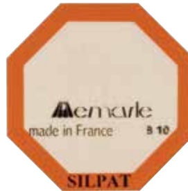
Silpat® Microwave (Octagonal) 0229 Size: 10.25" Peggable Box, 12 per case 814442009145