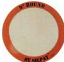
NEW Silpat® Round Mat 0237 Size: 9" Peggable Box, 12 per case 814442009220