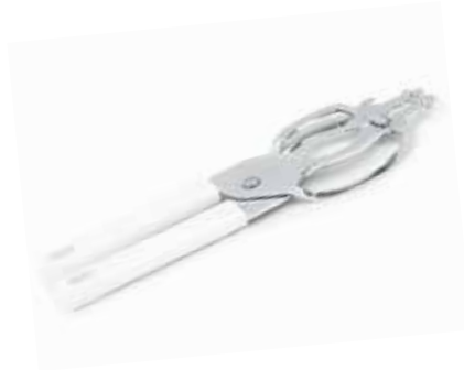
JAR & BOTTLE VISE 5648 Card, 6 per case 0-30734-05648-6