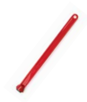
MAGNETIC CANNING LID WAND