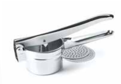
RICER / FRUIT PRESS 5773 10", Metal Product Wrap, 6 per case 0-30734-05773-5