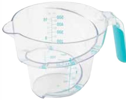
2 Cup Swirl Measuring Cup 73833

1 Cup Capacity Label, 6 per case 0-30734-73834-4