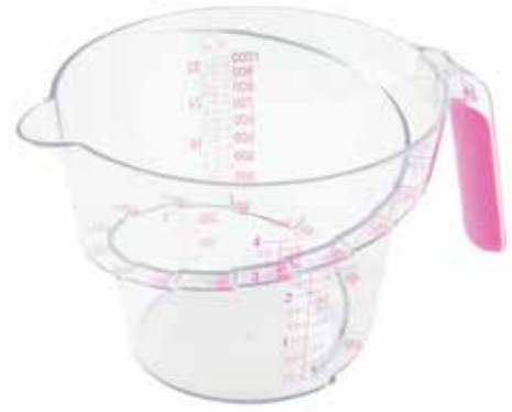
4 Cup Swirl Measuring Cup 73832

2 Cup Capacity Label, 6 per case 0-30734-73833-7