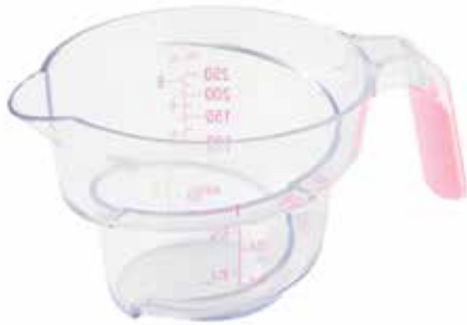
1 Cup Swirl Measuring Cup 73834

The Swirl Measuring Cup's graded swirl allows for liquids to be measured from above or from the side!