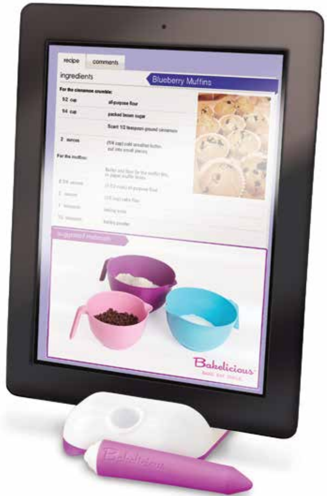
*Tablet NOT included.