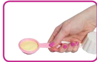
Mini Cupcake Batter Spoon