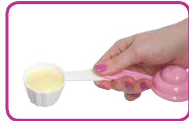
Standard Cupcake Batter Spoon