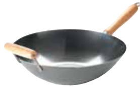
CARBON STEEL WOK

Heavy-gauge Carbon Steel with stay-cool handle. Suitable for high temperature cooking.