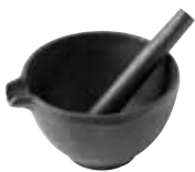
IRON MORTAR & PESTLE