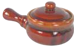
STONEWARE ONION SOUP BOWL

0350 3.5 qt. Box, 4 per case 0-30734-00350-3