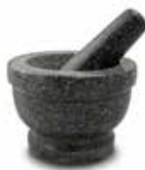
GRANITE MORTAR & PESTLE

6250 5.5" Box, 4 per case 0-30734-06250-0