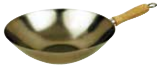
CARBON STEEL WOK

2734 12" Card, 2 per case 0-30734-02734-9