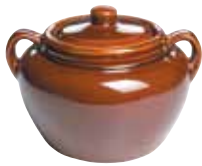
STONEWARE BEAN POT

0350 3.5 qt. Box, 4 per case 0-30734-00350-3