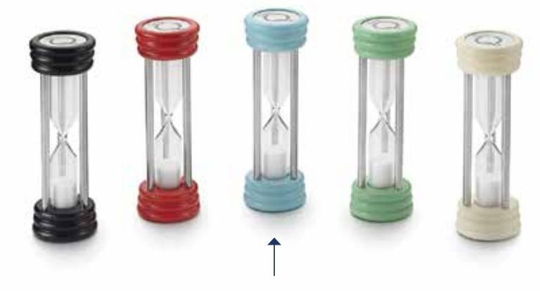
3 minute timers