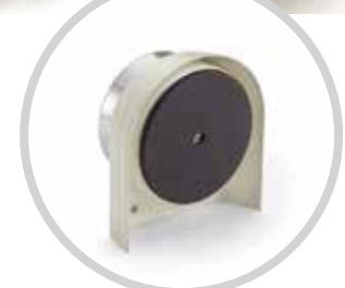
Handy magnetic back