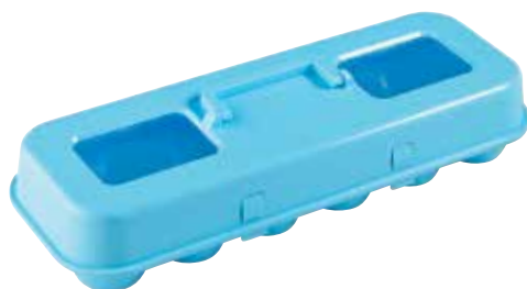
Blue Cupcake Carton 73901 Wrap, 12 per case 0-30734-73901-3