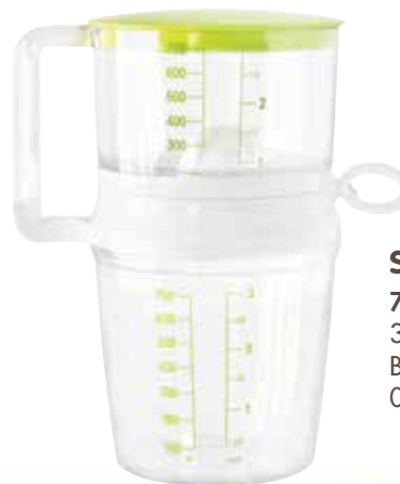
Swift Sift 73856 3 Cup Capacity Box, 3 per case 0-30734-73856-6