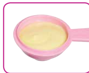
Mini Cupcake Batter Spoon