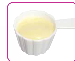
Standard Cupcake Batter Spoon