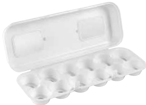
White Cupcake Carton 73902 Wrap, 12 per case 0-30734-73902-0

The easy, adorable way to bring your cupcakes anywhere! Cupcake Cartons feature a whimsical egg carton design that is sure to be the talk of the party. Made of food-safe (BPA-Free) plastic with two easy-viewing windows. Carry a dozen of your favorite cupcakes in style.