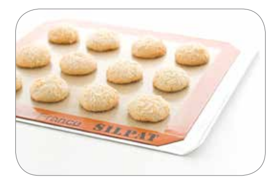
Silpat Cookie 0232

Size: 8.25" x 11.75" 12 per case 814442008001