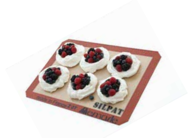
Silpat Toaster Size 0227

Size: 11^{5}/_{8} " X 16^{1}/_{2} " 12 per case 814442007332