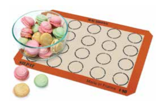
Silpat Macaroon 0231

Size: 17" X 12.25" 12 per case 814442004003