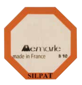
Silpat Microwave (Octagonal) 0229