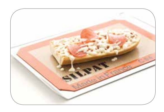
Silpat Petite Jelly Roll 0228

Size: 14<sup>3</sup>/<sub>8</sub>" X 9<sup>7</sup>/<sub>16</sub>" 12 per case 814442003655