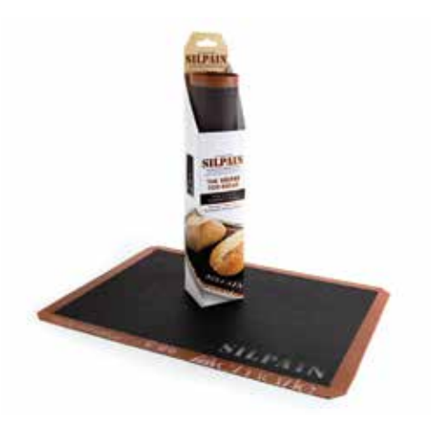
Silpain Half Size 0223

Size: 107/8" x 77/8" 12 per case 814442002757